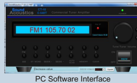
PC Software Interface